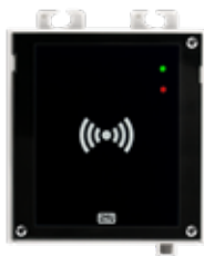
2N® ACCESS UNIT RFID

ord. 916009 (125kHz) ord. 916010 (13.56MHz)