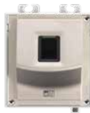
2N® ACCESS UNIT FINGERPRINT READER