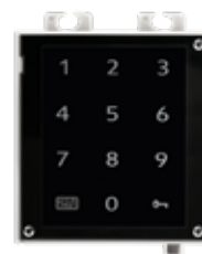
2N® ACCESS UNIT TOUCH KEYPAD