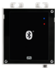
2N® ACCESS UNIT BLUETOOTH

ord. 916009 (125kHz) ord. 916010 (13.56MHz)